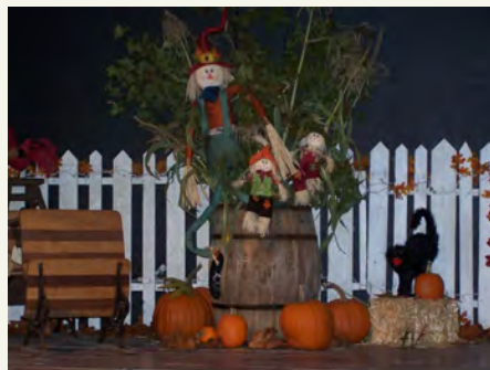
Stage Decorations -Oktoberfest 2010

FOCS has been rehearsing for Act II and beyond trying out the new spaces and functional props for receptions and family reunions. Each event was a real success and helped us be wonderfully ready to present Act II, Oktoberfest 2011 “Chinook Style”. Let the play continue!