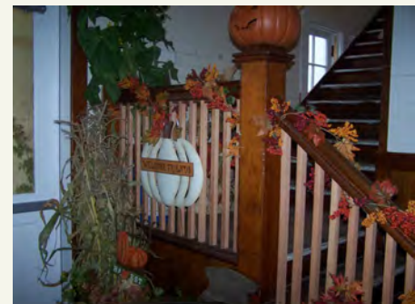
Welcoming Friends -2010